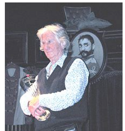
Augusto Boal receiving the Crossborder Award for Peace and Democracy .